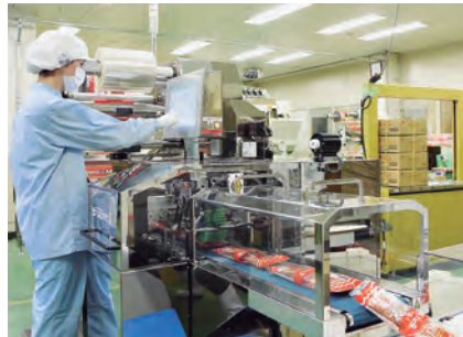
Dried Bonito Tuna Flake Manufacturing Line

We condition whole dried bonito tuna to make them just the right firmness for shaving, then we use far-infrared radiation roasting on a portion of them to keep them from losing their flavor. We then pack them in inert gas to help them keep their fresh flavor.