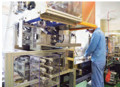
Bagged Soup Stock Manufacturing Line

Since the development of our granulated dried seafood soup stocks with no additives, which we first began selling in 1984, we have worked to create convenient soup stock seasonings, as well as granulated tea drinks, seasonings for lightly pickled vegetables, and other items to enrich customers' everyday meals.