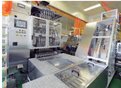
Granule Manufacturing Line

We condition whole dried bonito tuna to make them just the right firmness for shaving, then we use far-infrared radiation roasting on a portion of them to keep them from losing their flavor. We then pack them in inert gas to help them keep their fresh flavor.