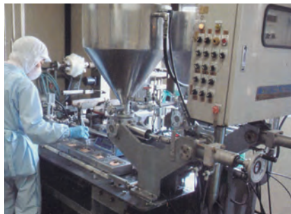
Firefly Squid Production Line

We roll each and every one of our kelp rolls by hand, and the careful work by hand continues through bagging and packaging each one, ensuring that our customers can truly feel the hand-made care in each one.