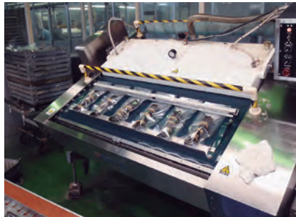
Kelp Roll Manufacturing Line

We bring our ingredients out of our refrigerated warehouse, where they're stored after initial inspection and grading, then check them once again and put them onto the feeding conveyor in the ratio needed. We then inspect the processed products before shipping them.