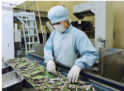
Boiled and Dried Seafood Manufacturing Line

We combine the choicest ingredients and seasonings with just the right balance, then pack this blend into unbleached paper packs or other packs, one by one. We offer soup stocks in both additive-free and seasoned varieties.